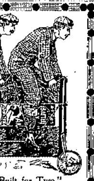
"A Bicycle Built for Two."